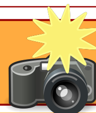
Photo Day September 14 th